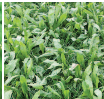
Chicory in grass